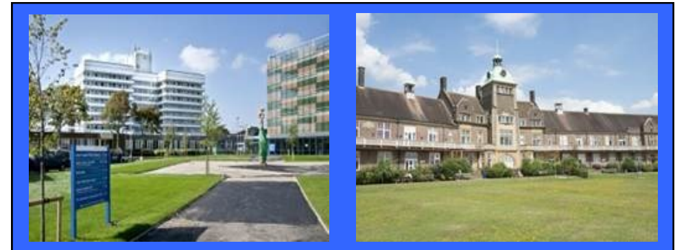
Lister Hospital Coreys Mill Lane, Stevenage, Herts SG1 4AB